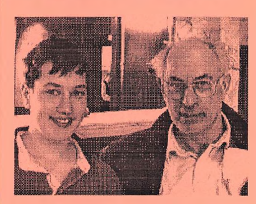
A guest and its young in their native habitat (the bar).